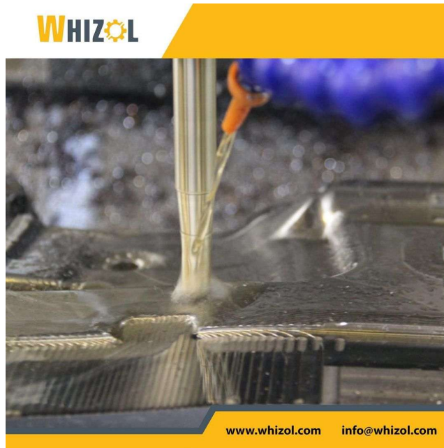
Close up milling process