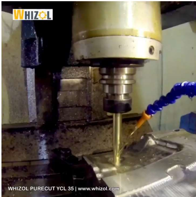
Milling process with YLC 35